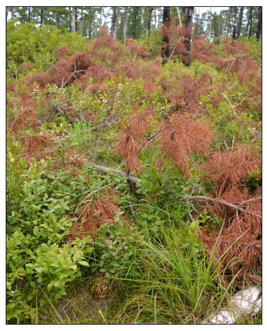
Above : An eastern box turtle (bottom left of photo) utilizing a forest that was burned by wildfire several years ago. The land owners are cutting the regenerating pine in an effort to restore oak trees.

Eastern Box Turtle Study: Staff continued to track box turtles with the hope of obtaining Environmental Protection Agency funding to initiate a robust box turtle study in 2022. In 2021, staff captured 15 box turtles within several different areas of the Pinelands. Radio transmitters were attached to 14 of the turtles and one turtle was marked and released without a transmitter because it was suspected to spend most of its time on private land. One of the radio tracked turtles was killed by an automobile, which is the first reptile tracked by Commission staff to have died from a vehicle collision. Staff met virtually with New Jersey Department of Environmental Protection Endangered and Nongame Species Program staff to continue