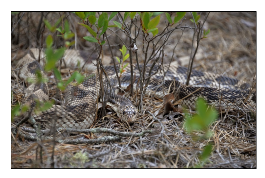
Above : A pine snake blending in naturally with its surroundings.