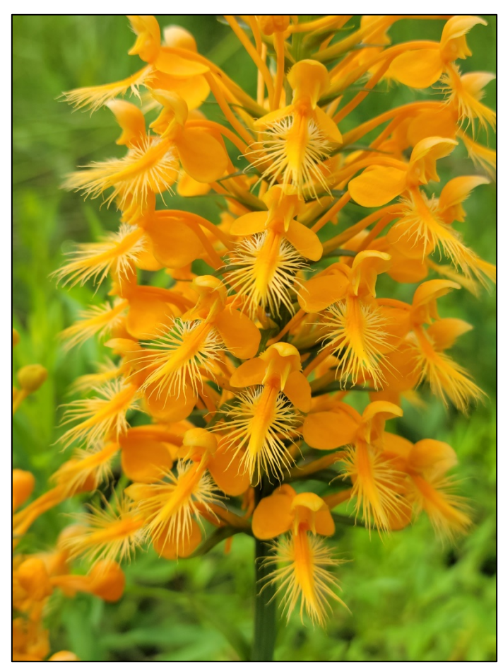
Above : Staff shared 79 photos on the Commission's Instagram site in July 2021, including this photo of a native orange fringed orchid in bloom.

Commission has contacted Facebook about the issue dozens of times.